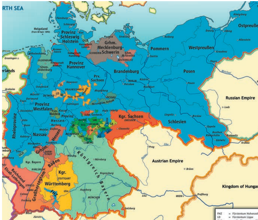
Germany during the "Second Reich" period, 1871–1918 (Kingdom of Prussia is in blue).