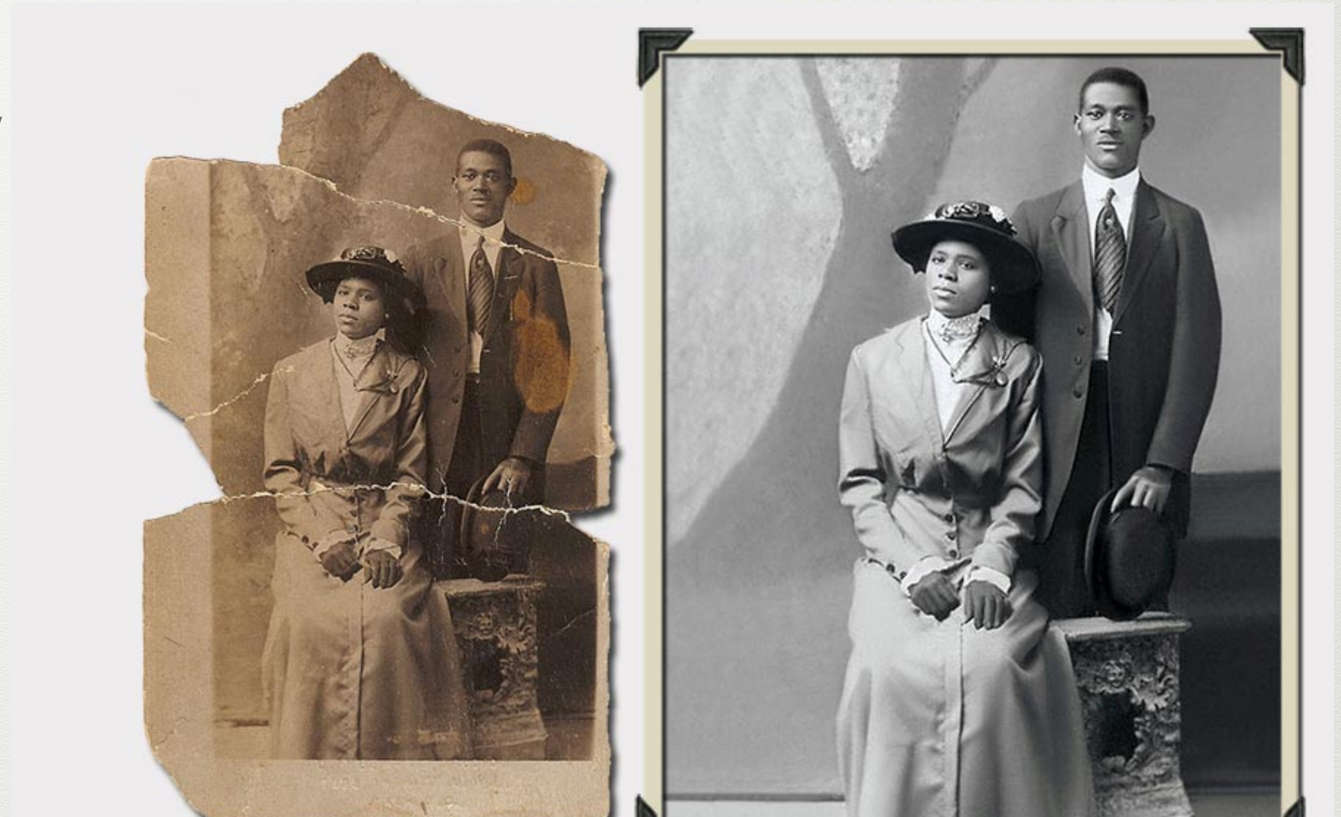
Correction includes filling missing areas.