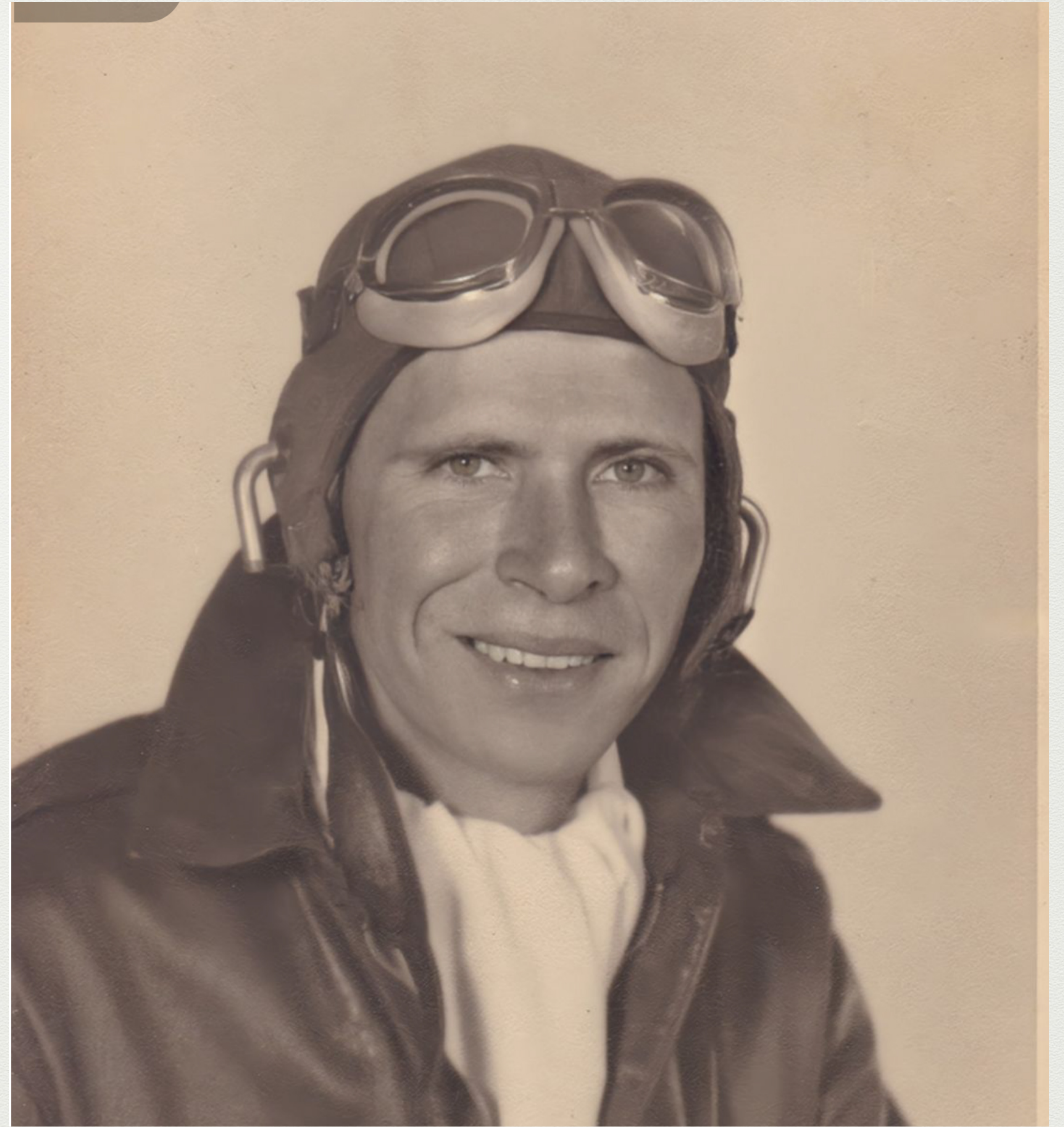
My Heritage Repair and Enhance