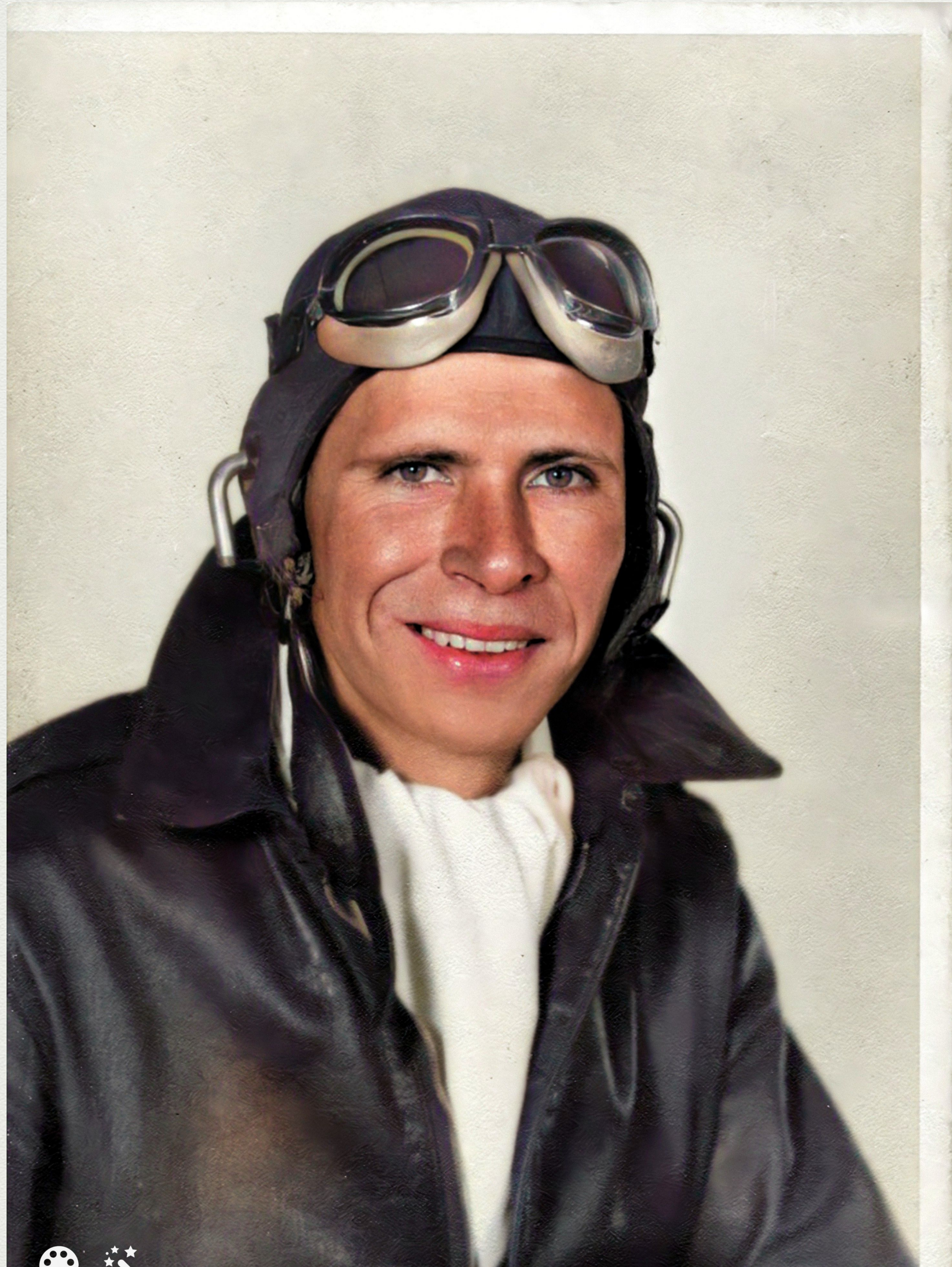
My Heritage: Repaired, Enhanced, Colorized