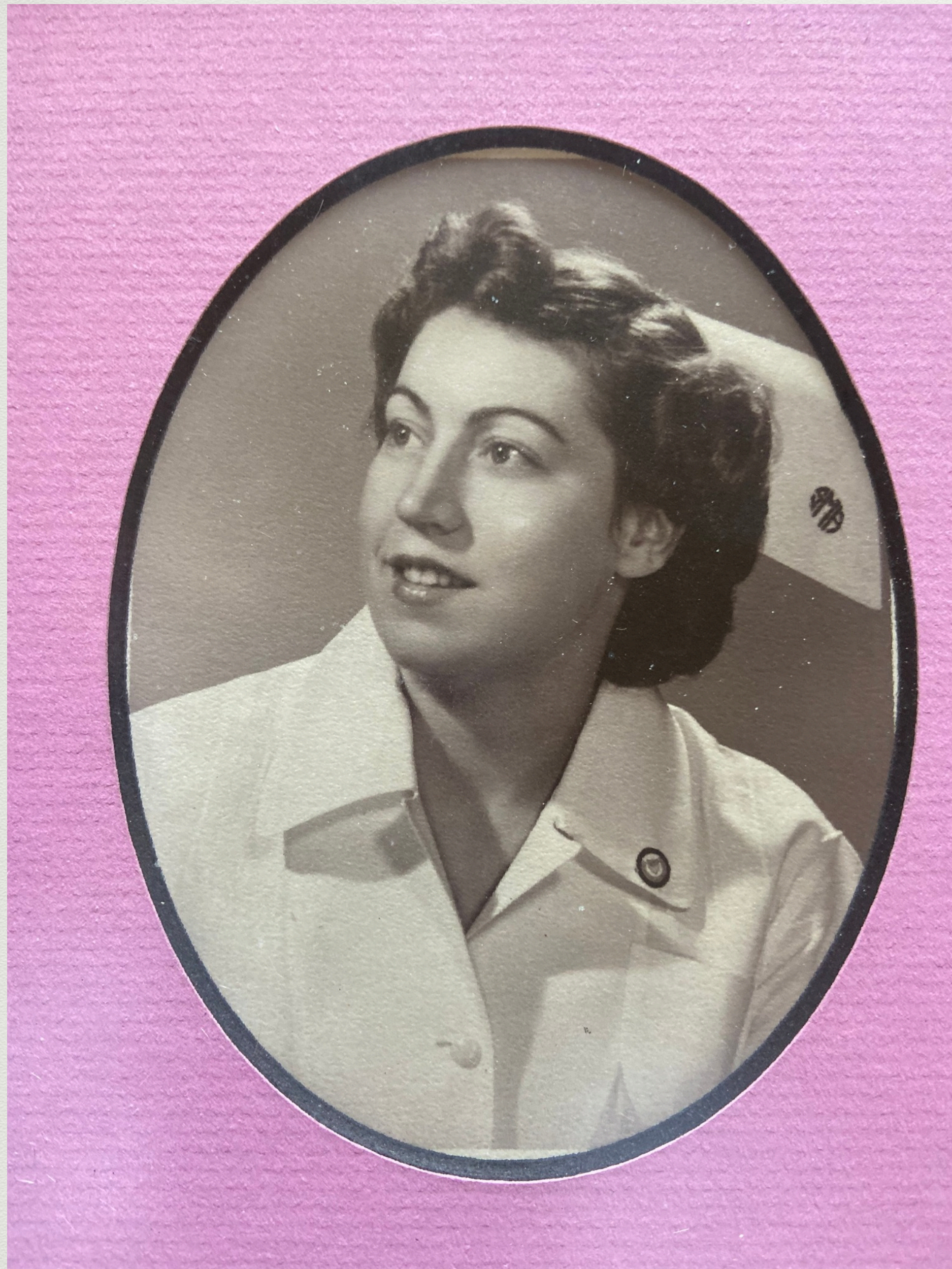
Original off Facebook