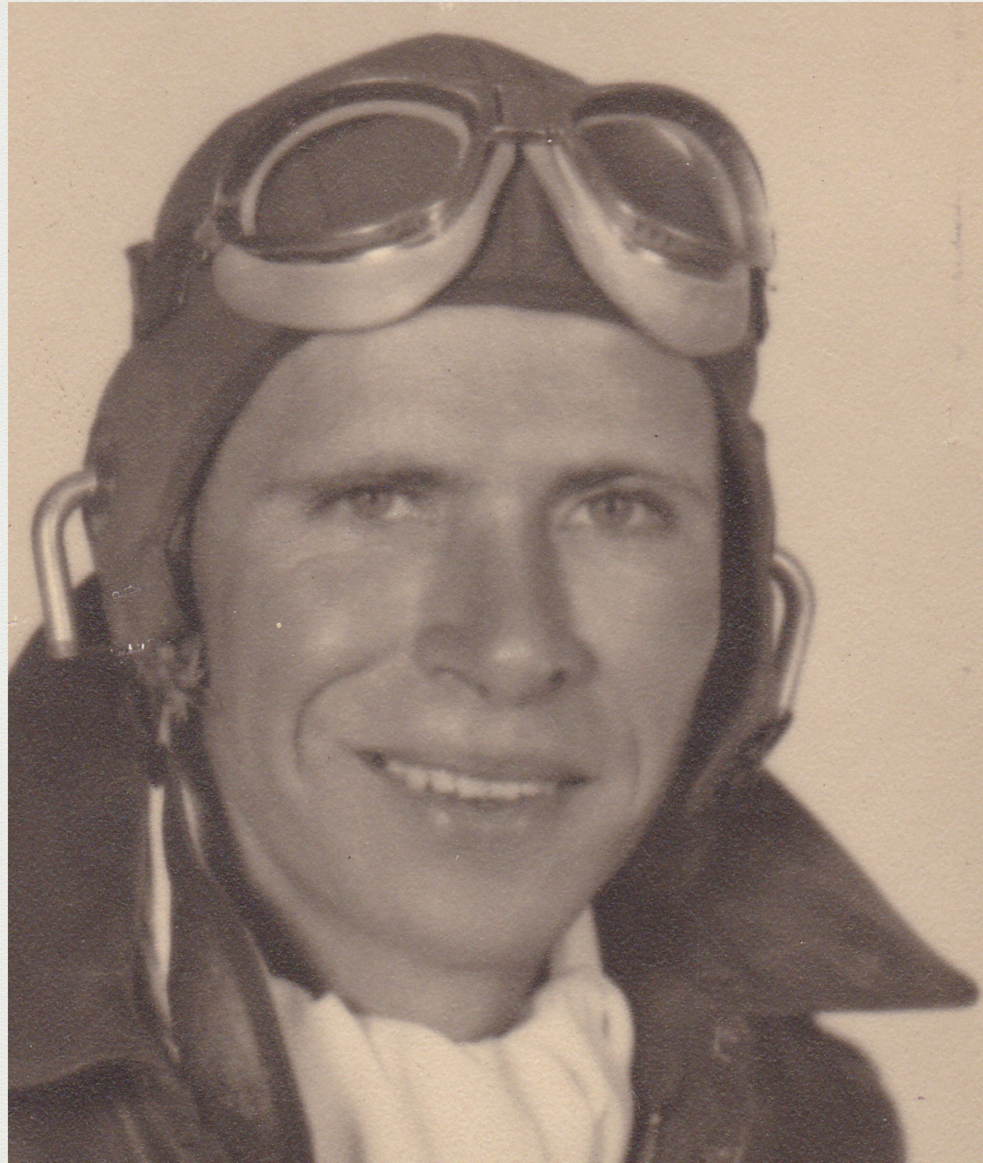
My Heritage Original