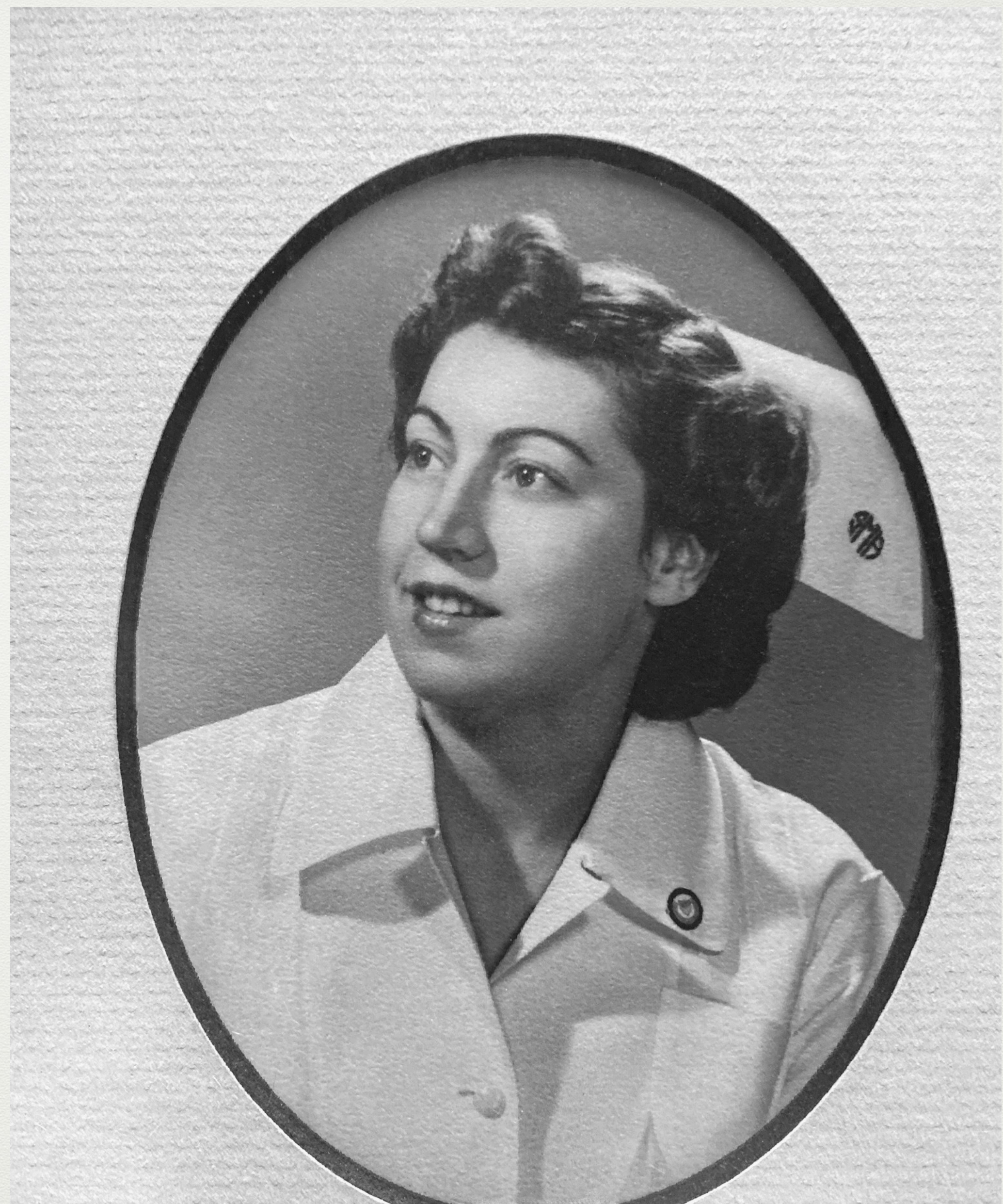
Repaired on Photoshop