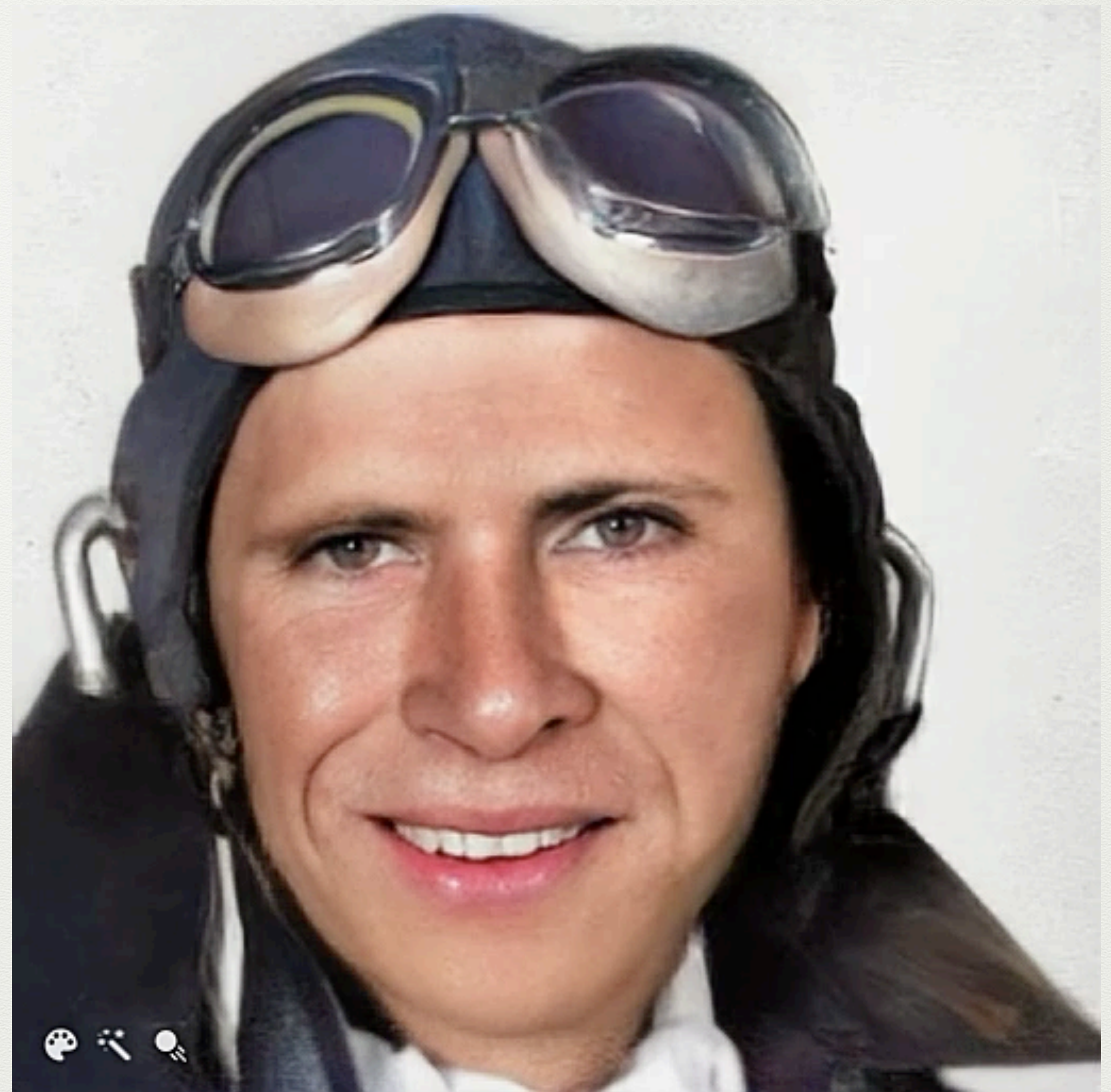
My Heritage: Repaired, Enhanced, Colorized, and Animated.