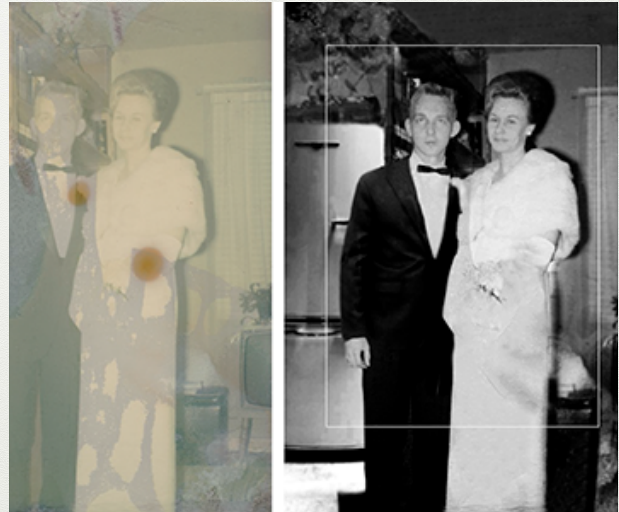
Color Photo Restoration to Black and White